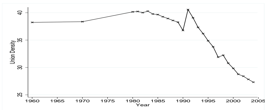
Figure 1: Evolution of Gross Union Density

Gross union density in percent; 1960–1990: West Germany; 1991–2004: Unified Germany. Union membership in CGB ( Christlicher Gewerkschaftsbund , data until 1999: German Statistical Office ( Statistisches Bundesamt , Statistische Jahrbücher ), union information thenceforward), DAG ( Deutsche Angestelltengewerkschaft , until 2000; data: German Statistical Office), DGB ( Deutscher Gewerkschaftsbund , data: www.dgb.de ), DBB ( Deutscher Beamtenbund , data: www.dgb.de ), and DPoIG ( Deutsche Polizeigewerkschaft , until 1970, data: German Statistical Office). Employment ( abhängig Beschäftigte ohne mithelfende Familienangehörige ) from German Microcensus: www.destatis.de .